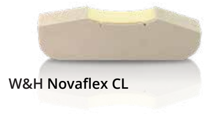
W&H Novaflex CL