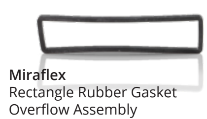
Miraflex Rectangle Rubber Gasket Overflow Assembly