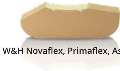
W&H Novaflex, Primaflex, Astraflex