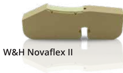
W&H Novaflex II