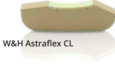
W&H Astraflex CL