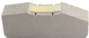
F1, F2 Plus