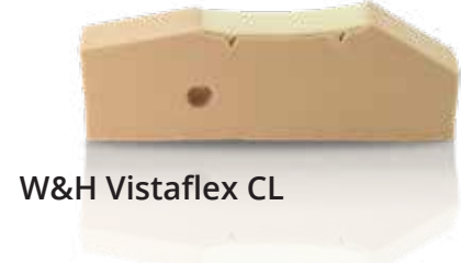
W&H Vistaflex CL