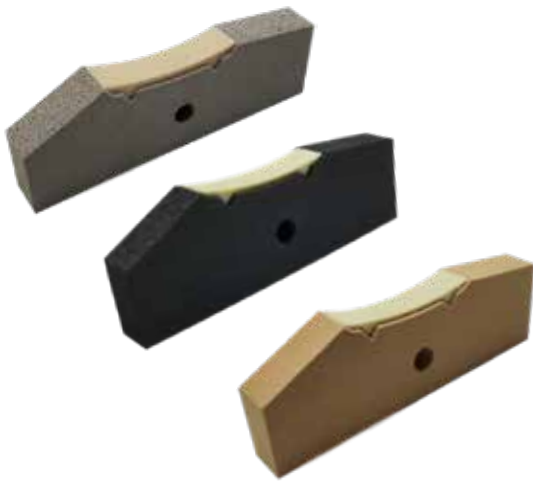
Maximized Sealing Properties End-to-End

As flexographic printers continue to push the boundaries with ever increasing productivity goals, they are looking to eliminate sources of downtime and waste. The ProSeals have been developed to provide the maximum seal life in the industry and to match the blade life achieved with the newest generation of SWED/CUT ® doctor blades. Market testing to date has proven our ProSeals to achieve over a week of productivity on many common flexographic presses on the market.