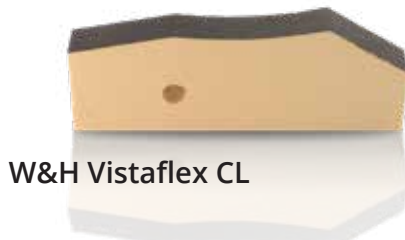
W&H Vistaflex CL