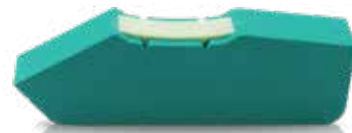
Soma Optima 1