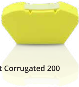
Bobst Corrugated 200