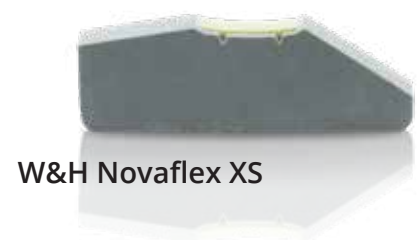
W&H Novaflex XS