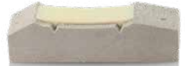
Bobst Master CI 90Six, 30Six