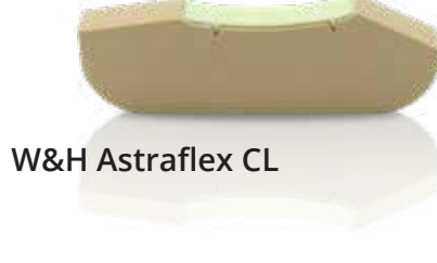
W&H Astraflex CL