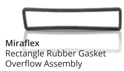
Miraflex Rectangle Rubber Gasket Overflow Assembly