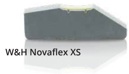
W&H Novaflex XS