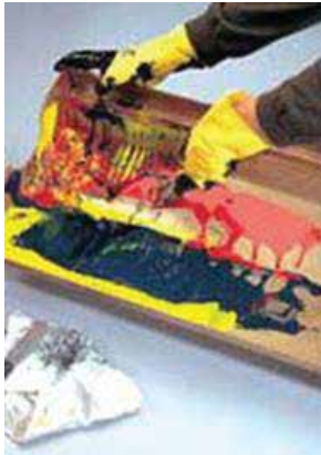
Clean-Up with Uncoated Pan

100P High Release Coating eliminates color contamination and reduces downtime for cleanings. Applicable to any existing equipment or specified to new equipment manufactured before delivery.