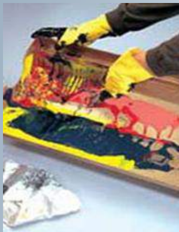
Clean-up with Uncoated Pan

FLXON Incorporated 8531 Crown Crescent Court Charlotte, NC 28277 Tel: +1.704.844.2434 Toll Free: 800.756.6474 Email: wecare@flxon.com