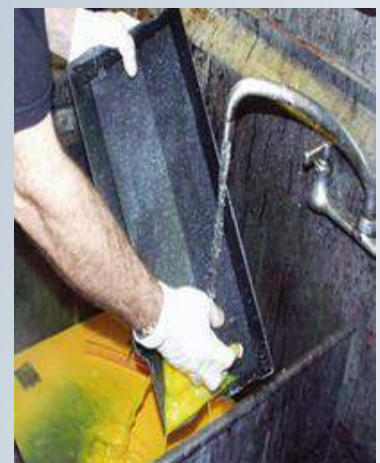
Clean-up with Coated Pan